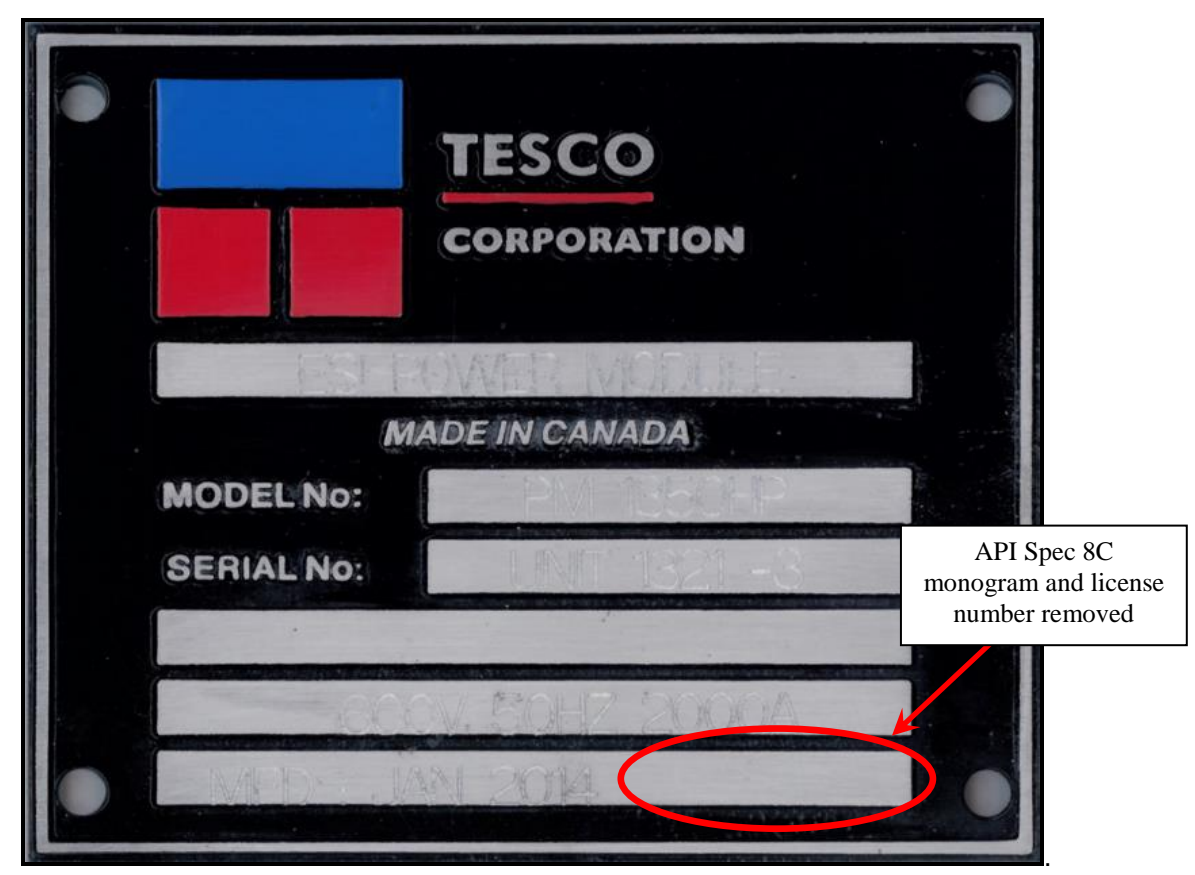
Figure 3: Power module nameplate with API Spec 8C engraving removed