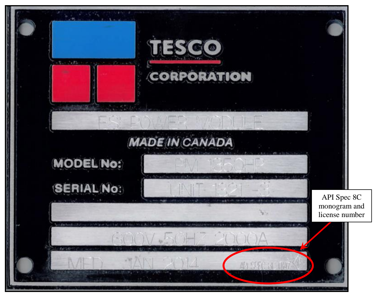
Figure 1: Power module nameplate with API Spec 8C incorrectly engraved on

The nameplates on several of the TESCO Top Drive power modules and manifolds, as well as CDS units, were inadvertently engraved with the API Spec 8C monogram and license number (Figure 1 and Figure 2). The power modules, manifolds and CDS units do not require API certification, therefore the nameplates should not have an API monogram and license number engraved.