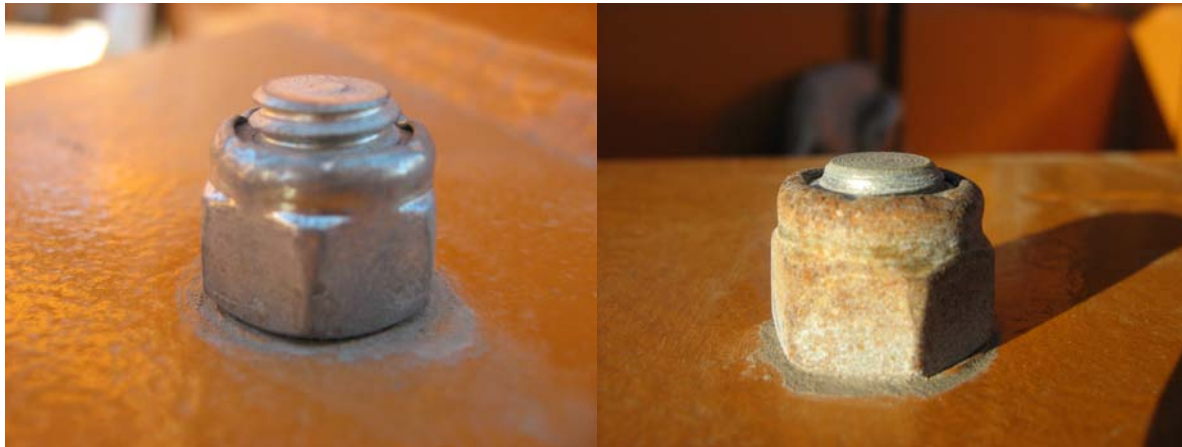
Acceptable At least 2 threads Protruding through nylon

It came to Tesco’s attention that in some instances the special bolts used to mount UHMW liners to torque restraint may not have enough threads protruding through the nylon locknuts. ECN-141-0086 updated the bill of materials to use Stover locknut (Tesco#1410105) instead of nylon locknut (Tesco# 4333).