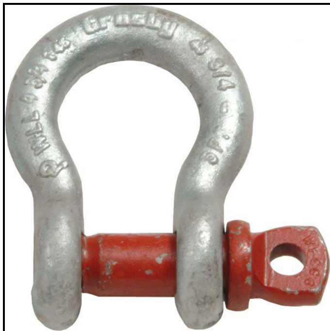
Figure 1: Screw-Pin Anchor Shackle

It was noted that several shackles TESCO currently utilizes throughout the product offering are of the screw-pin anchor type. Screw-pin anchor shackles do not include secondary retention for the pin (Figure 1), therefore, they do not comply with TESCO’s overhead equipment policy. TESCO is acting to supersede all screw-pin anchor shackles with bolt-type anchor shackles that include secondary retention (Figure 2) to comply with our overhead equipment policy.