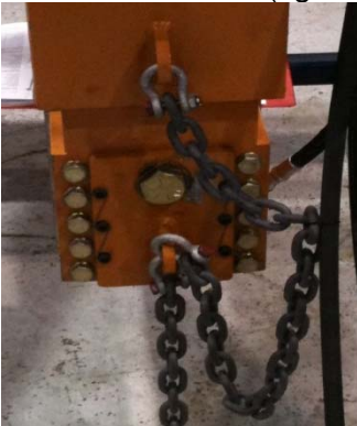
Figure 2: Grabber leg safety chain