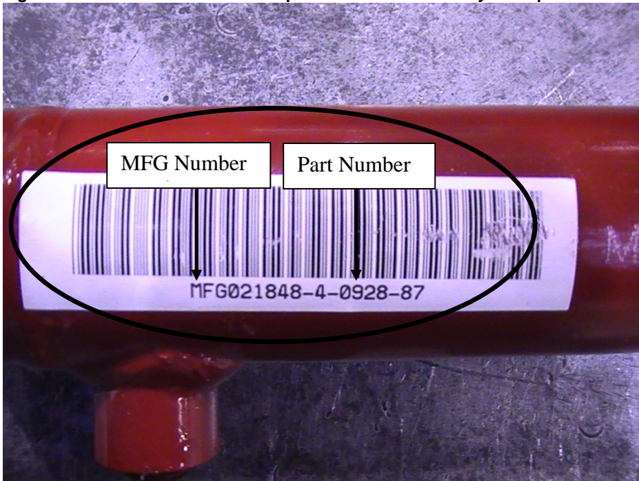
Figure 4: Manufacturer number and part number shown on cylinder piston

Contact your local TESCO Parts and Service Center for further information regarding this bulletin and or supply of affected components noted above.