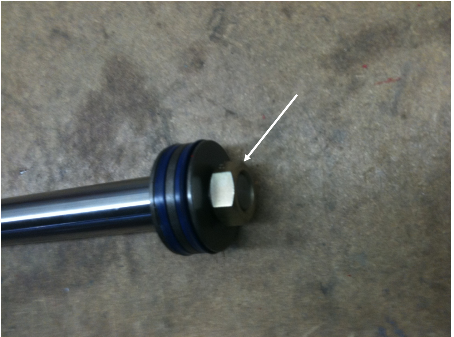
Figure 1: Cylinder rod end without locking Stover ® nut

During a recent investigation into failed hydraulic cylinders Tesco has discovered a number of cylinders do not conform to desired specification. The fasteners holding the cylinder piston to the rod were not the locking Stover ® type used by Tesco (Figure 1). This may allow the nut to separate from the cylinder rod during normal use allowing the cylinder rod end to part from the cylinder piston.