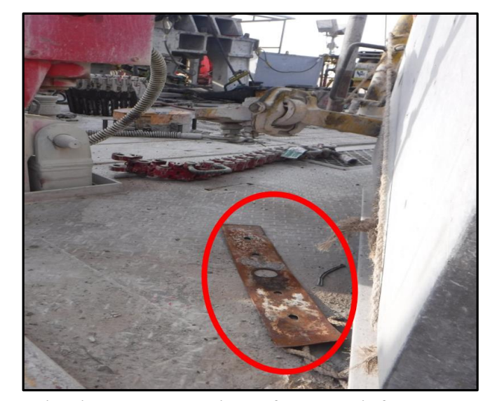
Figure 1: Bolts heads from torque restraint sheared, causing liner and metal shims to fall to the rig floor

The top drive had been in operation for approximately six months when the incident happened. Initial reports indicate that the liner was worn past acceptable operating limits, exposing the liner bolts. This resulted in the bolts shearing off (Figure 2) which contributed to failure of the torque restraint liner described above. It is unclear at this time whether the torque restraint liner had undergone a prior visual inspection and replacement as recommended in the top drive maintenance guide.